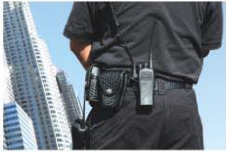
Three Tier Security

Parx Residency is the only project in Panipat on NH 1, to usher in the unique concept of Landscaped Podium. The Podium allows you a carpet of uninterrupted, landscaped greenery. The expansive provision of underground parking offers uninterrupted green vistas, a veritable feast for the eyes.