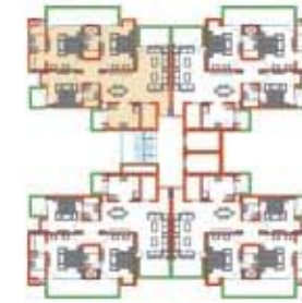
Tower: L & N