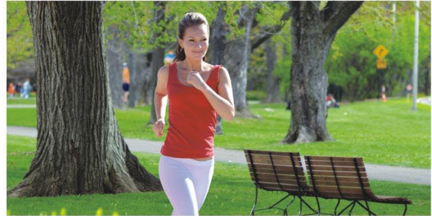
Beautiful Podium Landscaping with Jogging Tracks