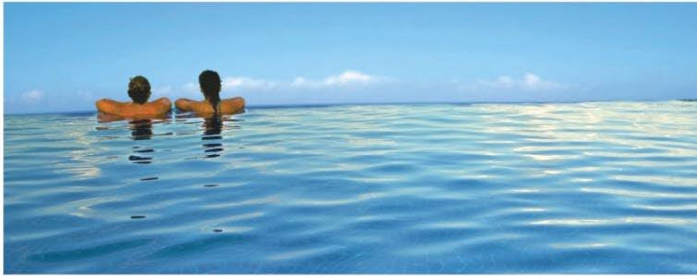
Luxury Infinity Pool