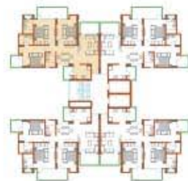
Tower: C, D, E, F, G, H, K, O & P