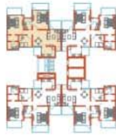
Tower: A, B, I & J