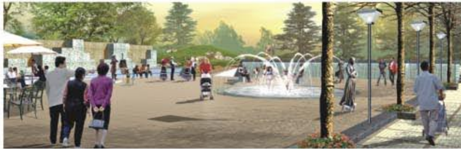
Water Features with Lush Green Landscape