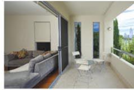
Spacious Rooms with Large Balconies